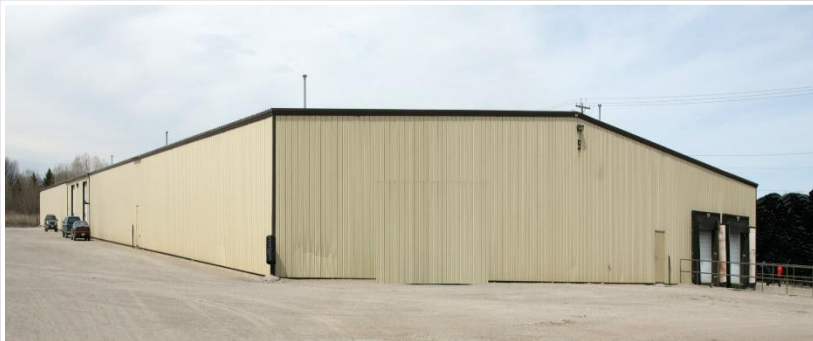
Excellent Warehouse space available in the Town of Grand Chute with 2 loading docks.

415 N. LILAS DR. • TOWN OF GRAND CHUTE • OUTAGAMIE COUNTY