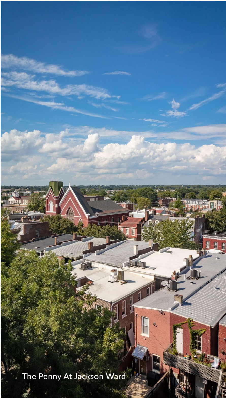
The Penny At Jackson Ward