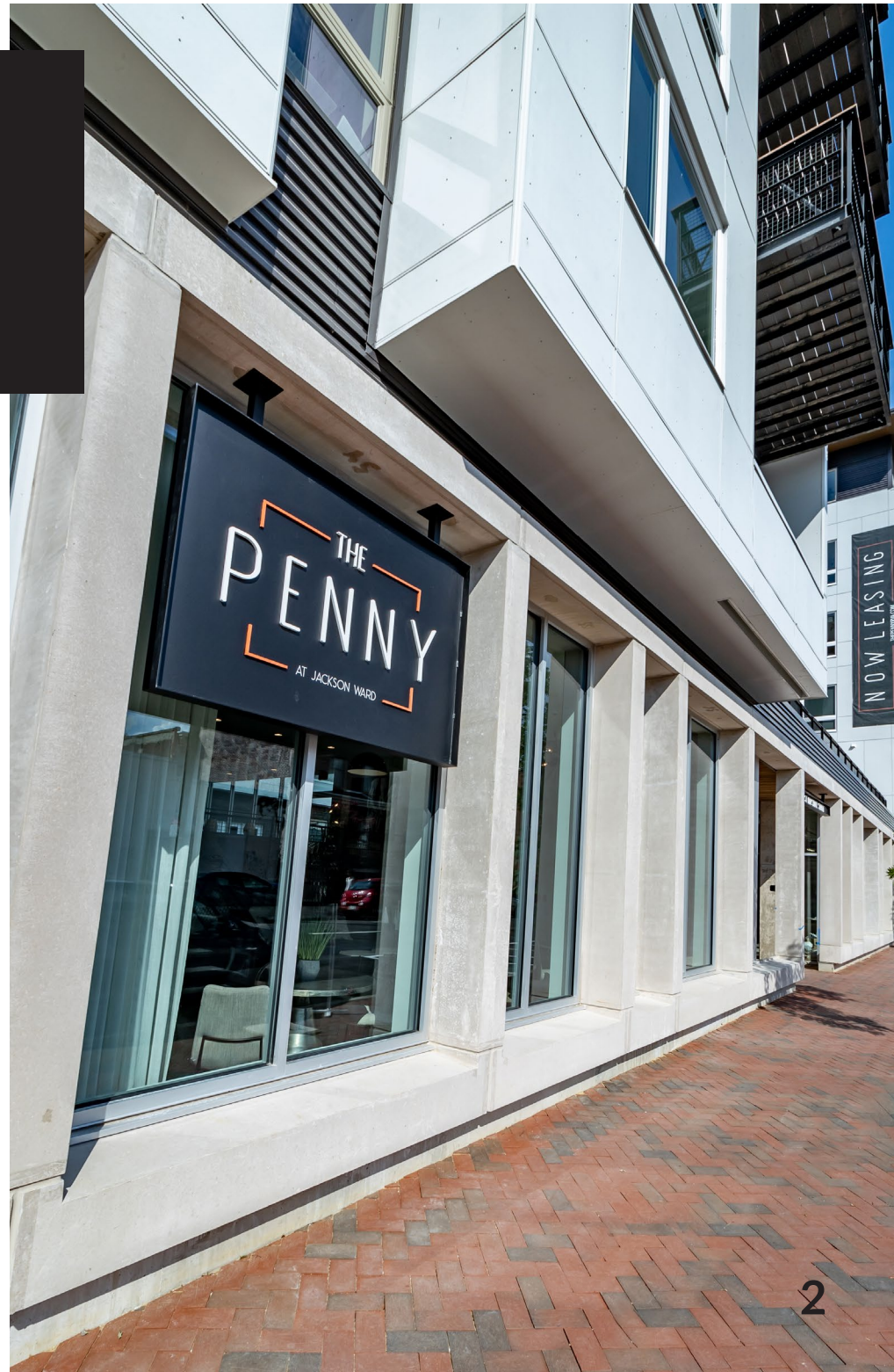
The Penny At Jackson Ward