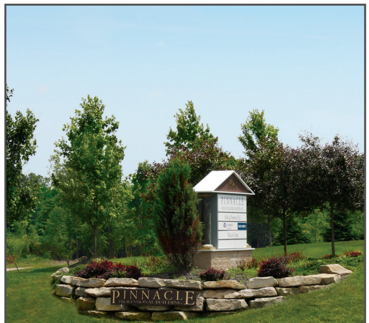
Monument signage at street