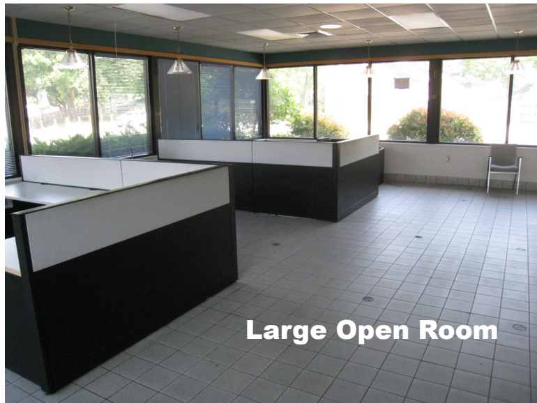
Large Open Room