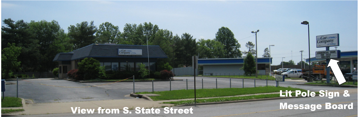
View from S. State Street