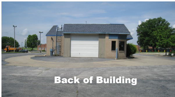
Back of Building