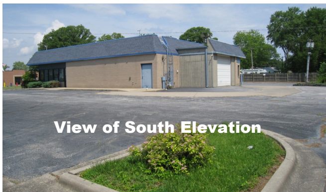
View of South Elevation