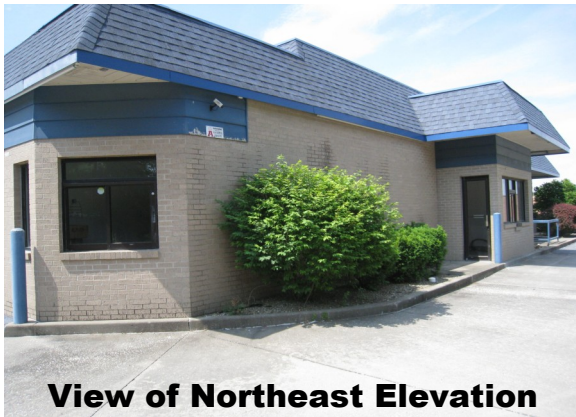
View of Northeast Elevation