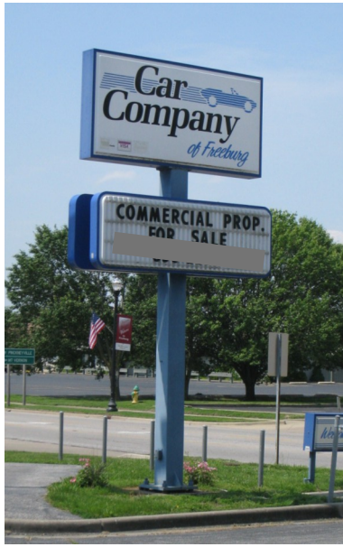
Large Lit Pole Sign with Message Board

2,948 SF Building on 1.13 Acres Most Recent Use: Car Dealership Initial Use: Hardees Restaurant