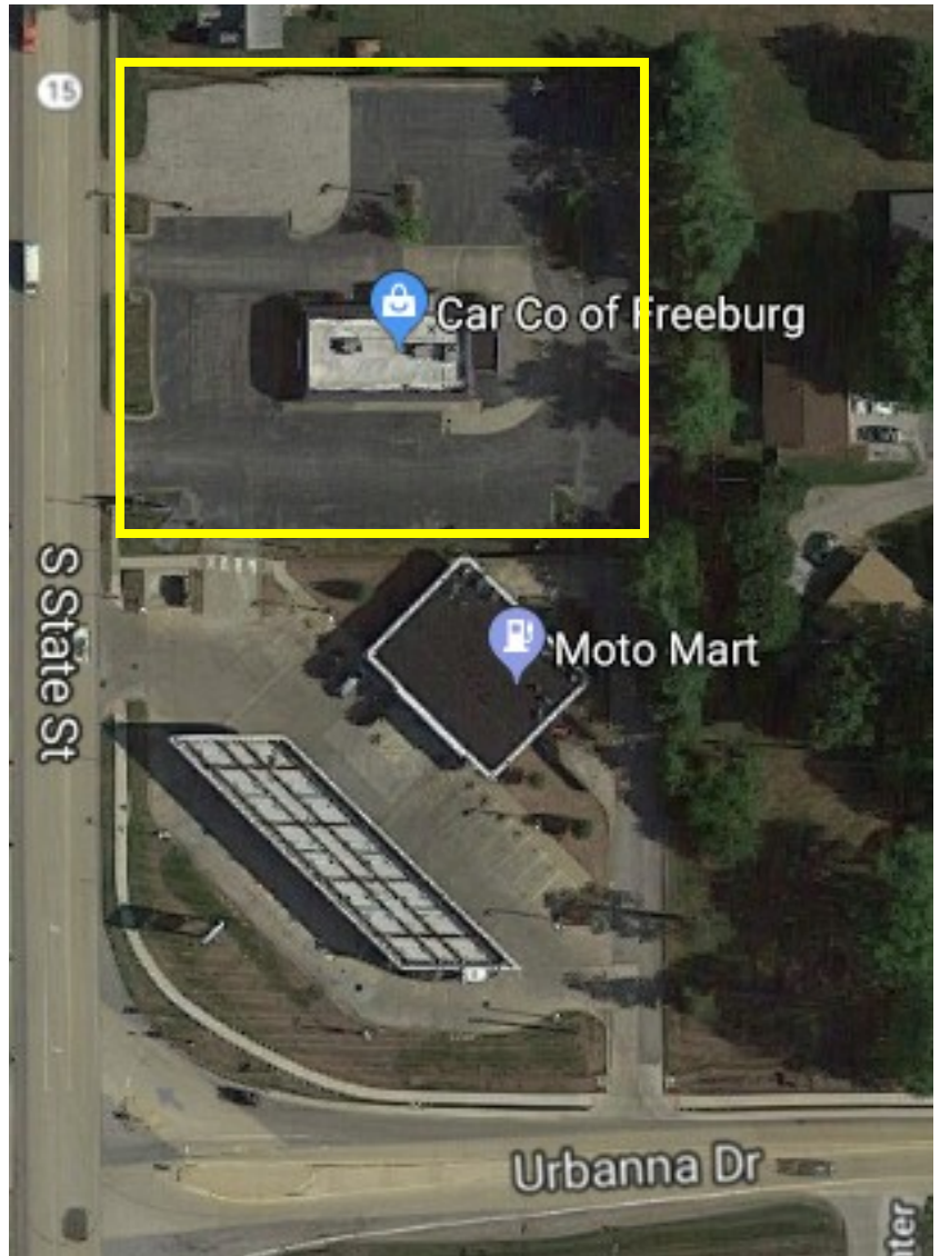
Aerial View. Subject Property Highlighted. Property is bordered by Moto Mart CFM to the South