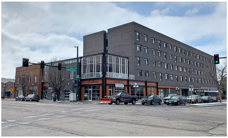
PICTURED: NEW 110 UNIT DEVELOPMENT ACOMA LOFTS

Joey Gargotto 720 881 7540 jgargotto@shamesmakovsky.com