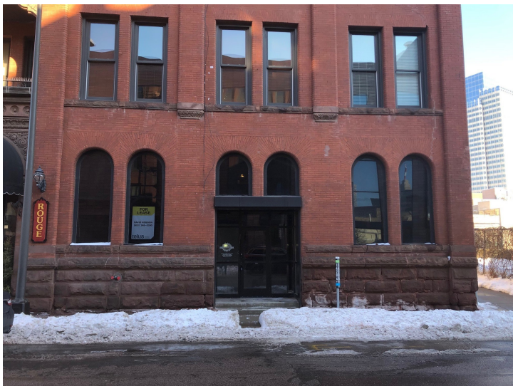
Space B Front Door Entrance