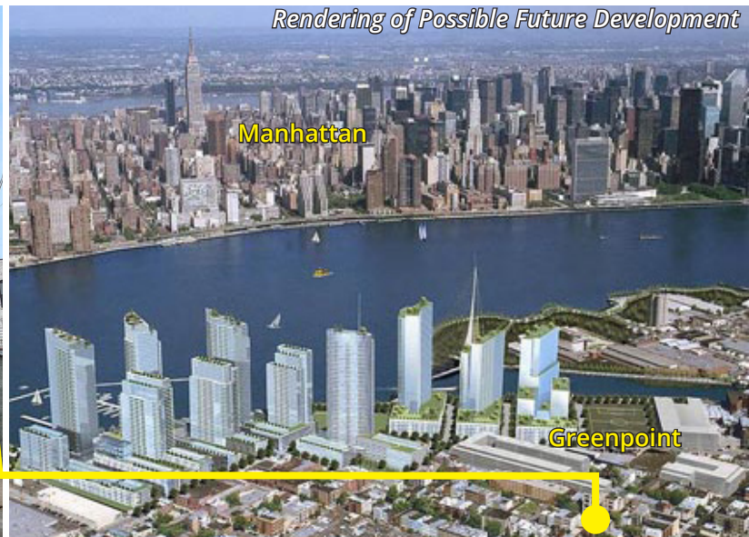
Rendering of Possible Future Development