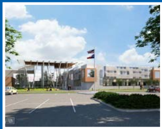
CAREER TECHNOLOGY EDUCATION HIGH SCHOOL