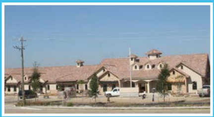
THE MEDICAL RESORT AT BAY AREA