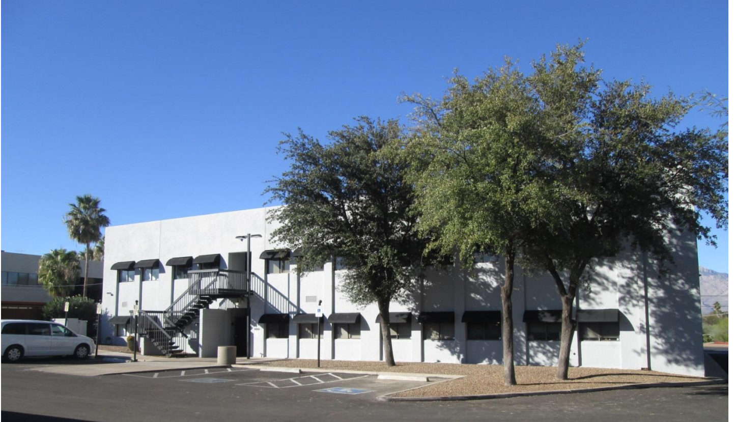
South View of Building