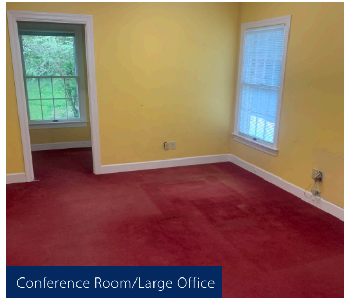
Conference Room/Large Office