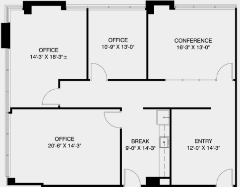
Suite 105 1,655 RSF