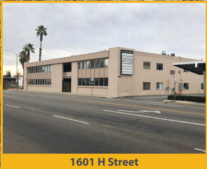
1601 H Street