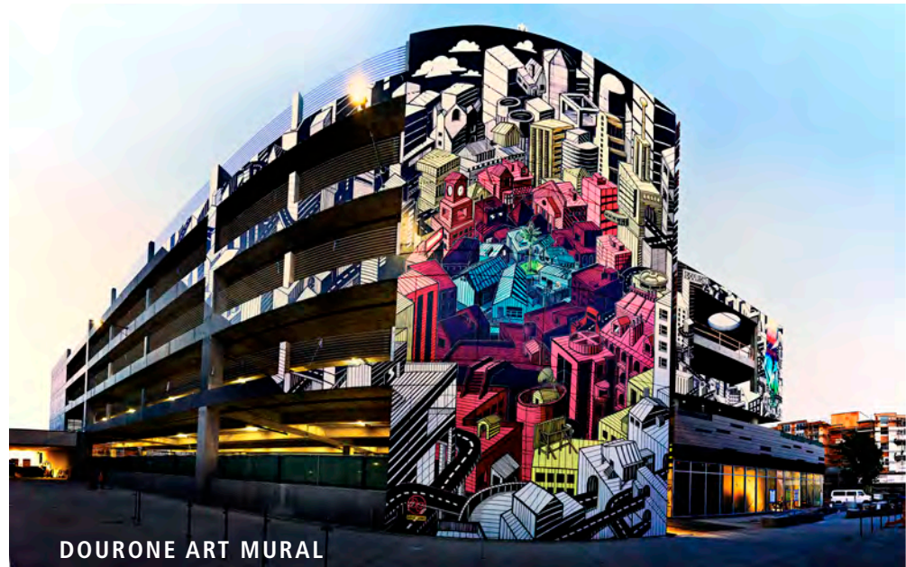
DOURONE ART MURAL