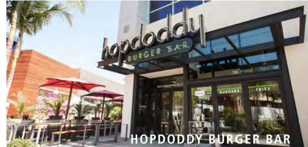
HOPDODDY BURGER BAR