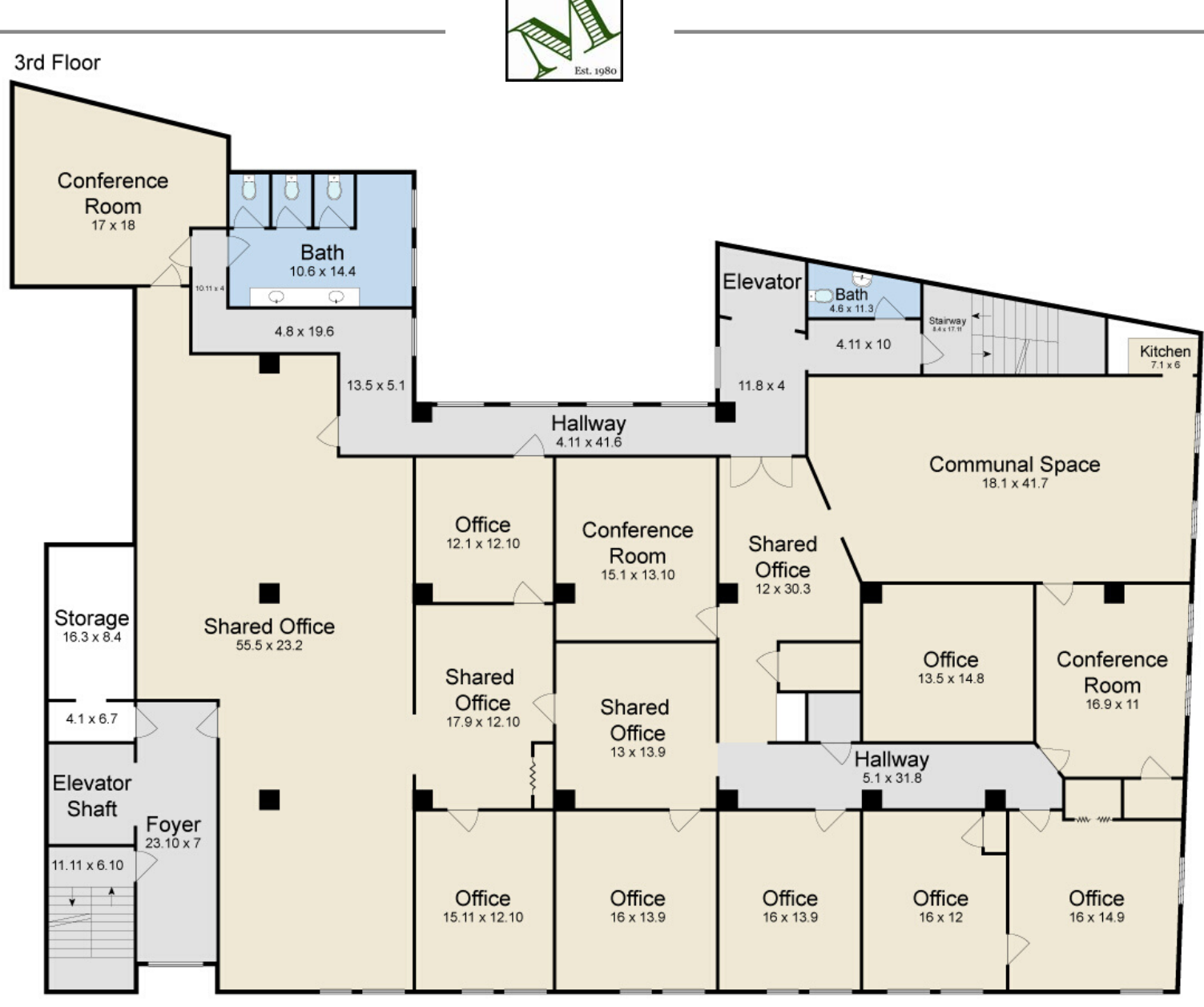
For guidance only