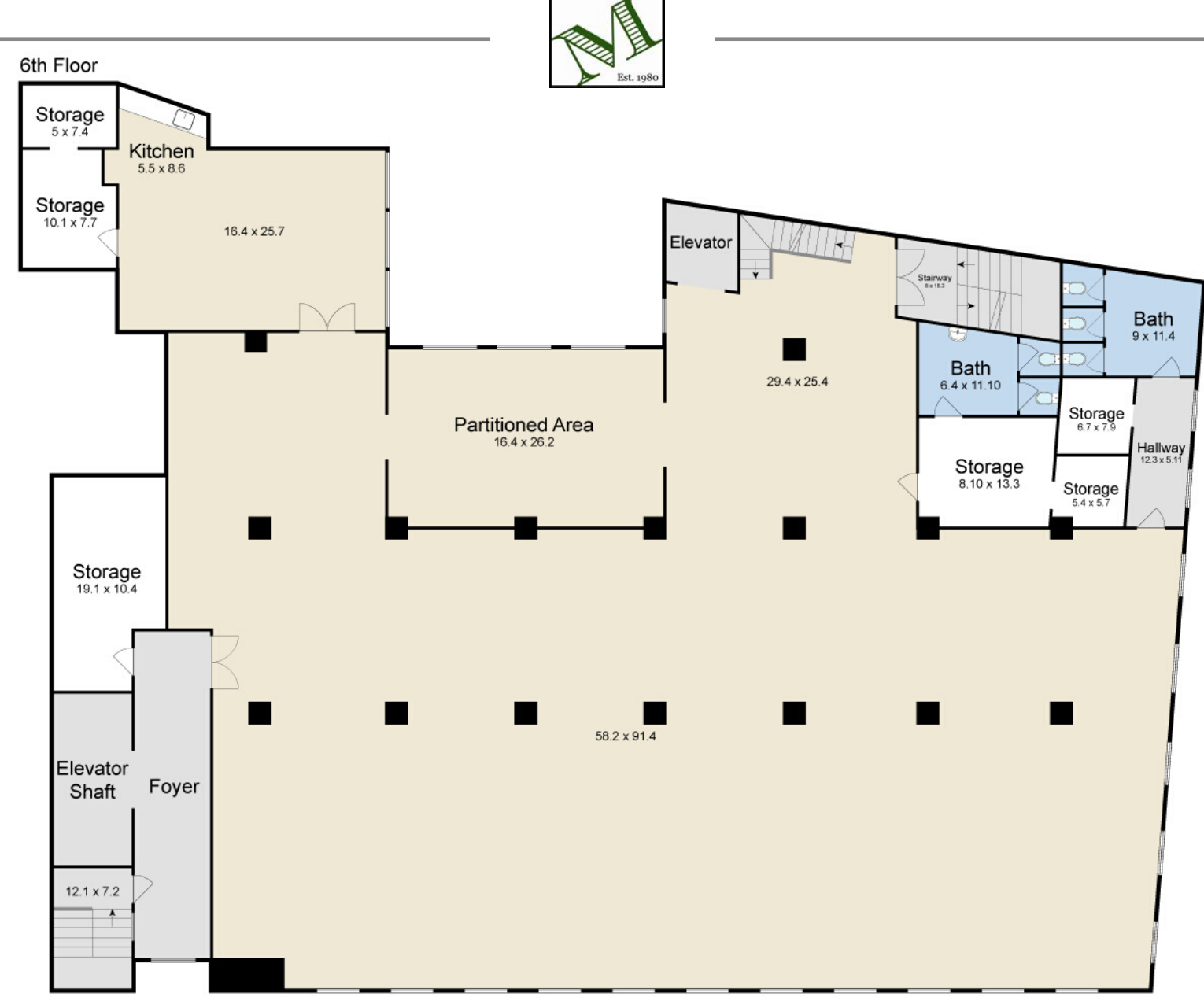
For guidance only