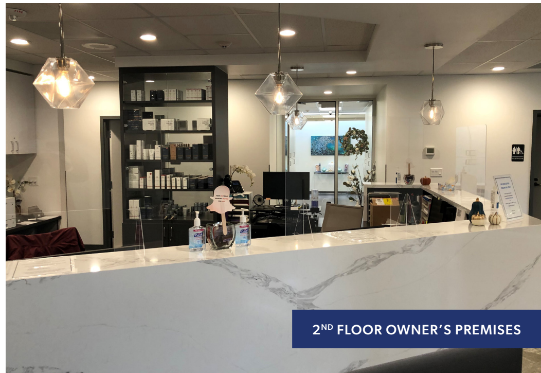
2 ND FLOOR OWNER'S PREMISES