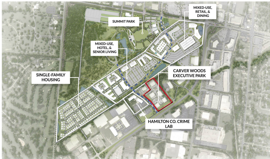
Development Progress Map | Blue Ash, OH --- Access to Summit Park and Glendale Millford Road