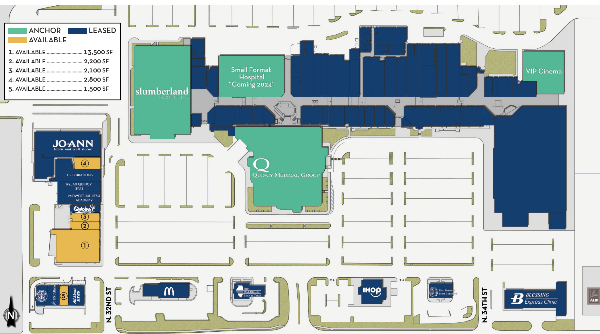
BROADWAY ST (35,200 VPD)

LEASING CONTACT: EDDIE CHERRY eddie@manorrealestate.com 314.647.6611