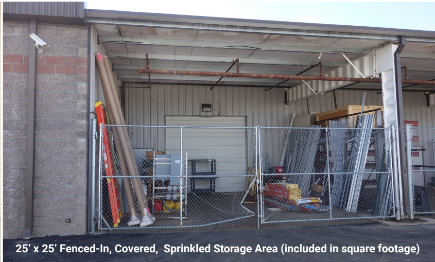
25' x 25' Fenced-In, Covered, Sprinkled Storage Area (included in square footage)