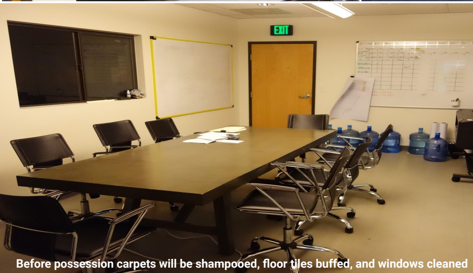
Before possession carpets will be shampooed, floor tiles buffed, and windows cleaned