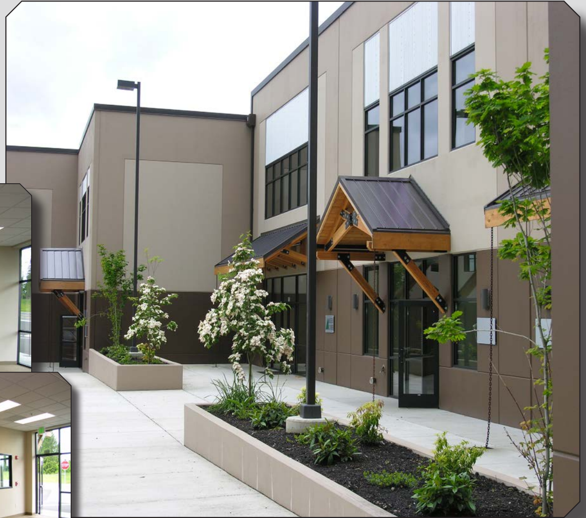
General ML Office & UL Office Photos