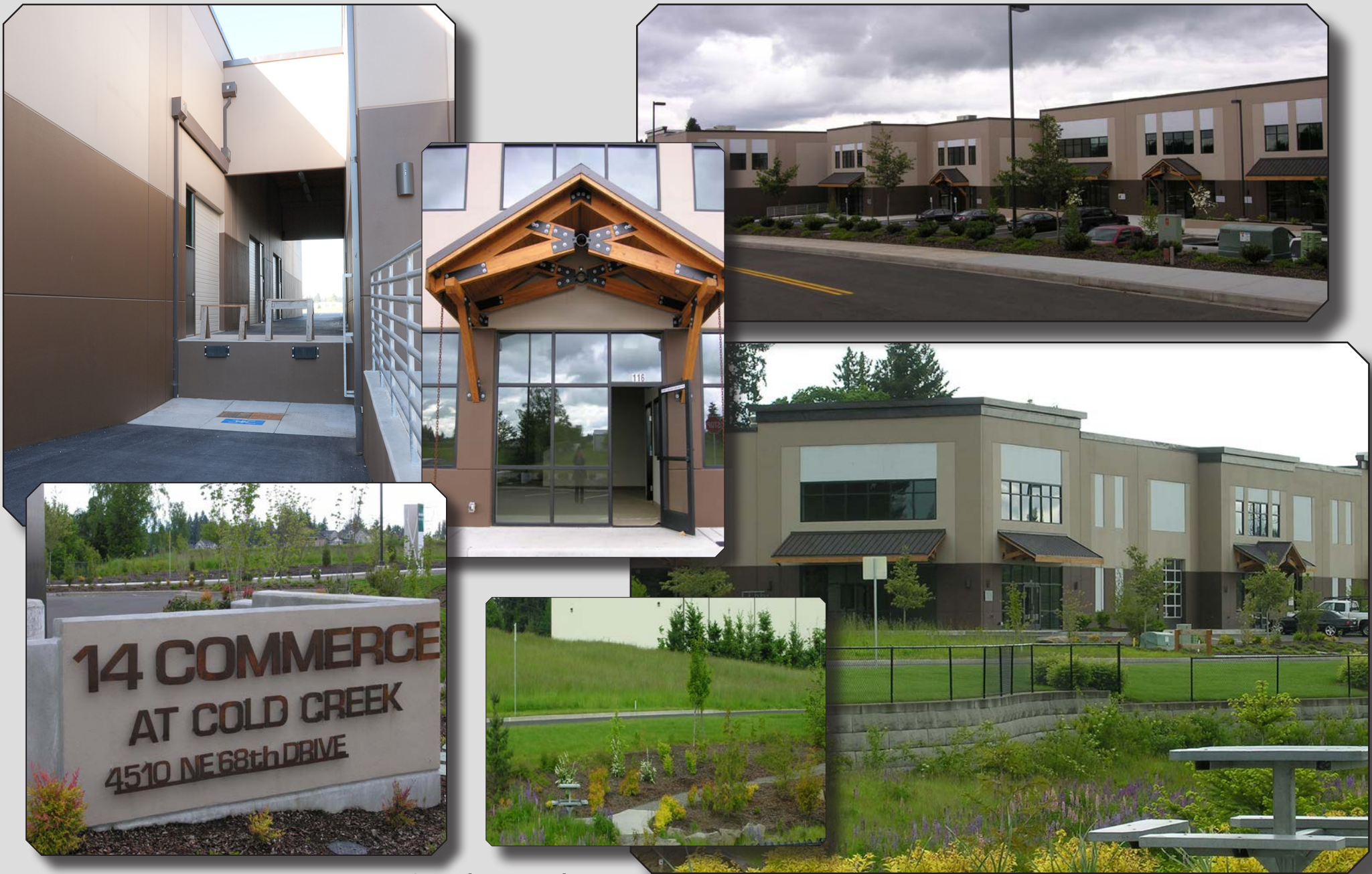
General Exterior Photos