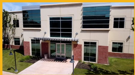
9201 Camino Media