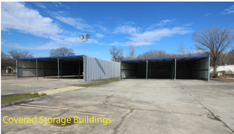
Covered Storage Buildings