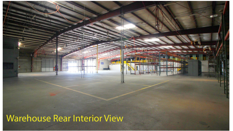
Warehouse Rear Interior View