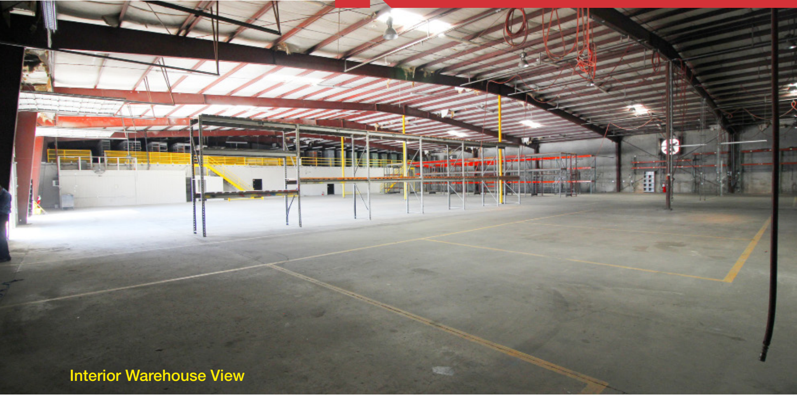
Interior Warehouse View

Office/Warehouse with Surplus Paved Land 14910 Henry Road, Houston, TX 77060