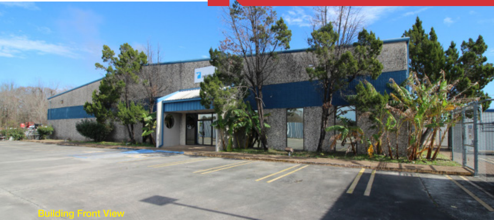
Building Front View

Office/Warehouse with Surplus Paved Land 14910 Henry Road, Houston, TX 77060