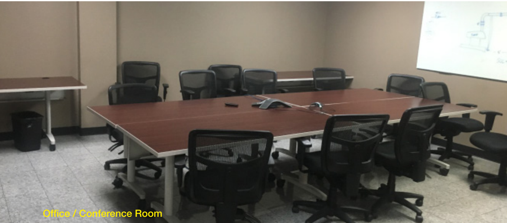
Office / Conference Room