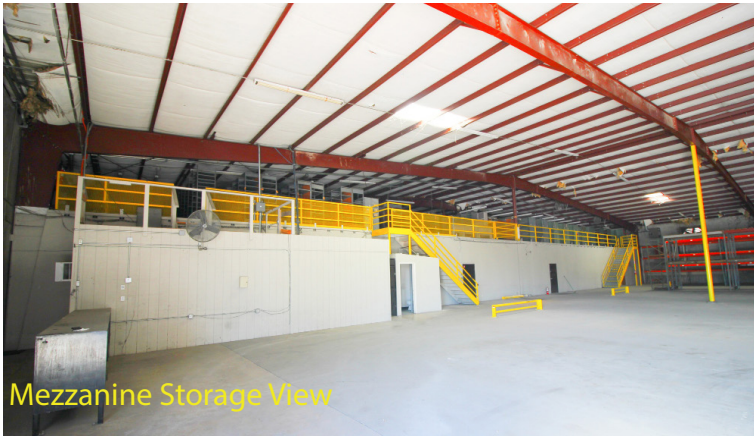
Mezzanine Storage View