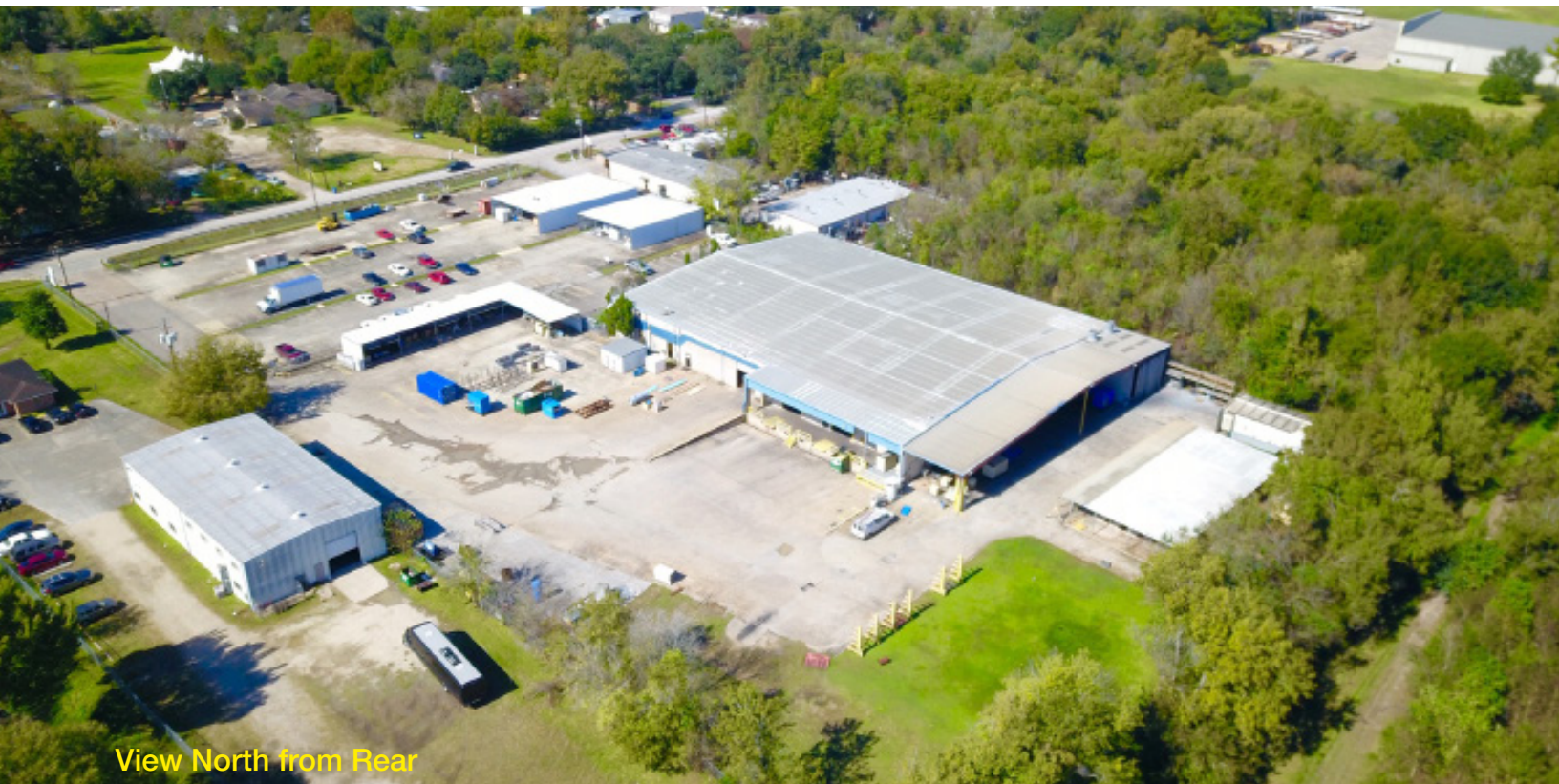
View North from Rear