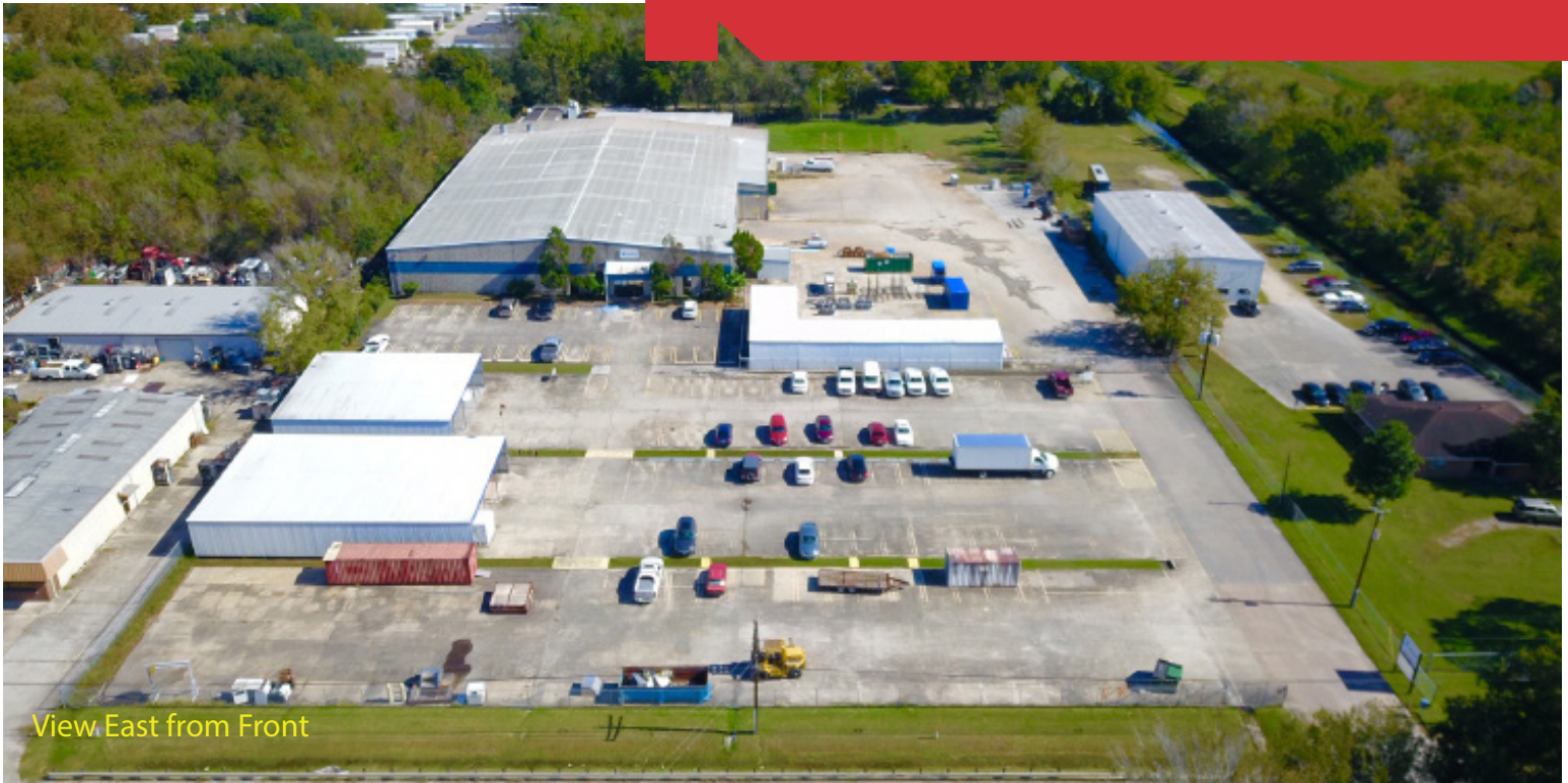
View East from Front

Office/Warehouse with Surplus Paved Land 14910 Henry Road, Houston, TX 77060