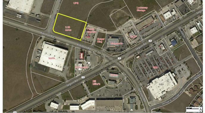
© 2019 Colglazier Properties. All rights reserved.

Listing ID: 30334945 Status: Active Property Type: Vacant Land For Sale Possible Uses: Office, Retail Gross Land Area: 2.28 Acres Sale Price: $1,492,366 Unit Price: $654,546 Per Acre Sale Terms: Cash to Seller Nearest MSA: San Antonio-New Braunfels County: Bexar Tax ID/APN: 17730-000-0171 Zoning: C-3 AND I-1 Property Visibility: Excellent