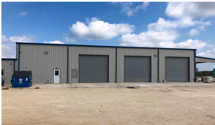
Exterior - Building 1