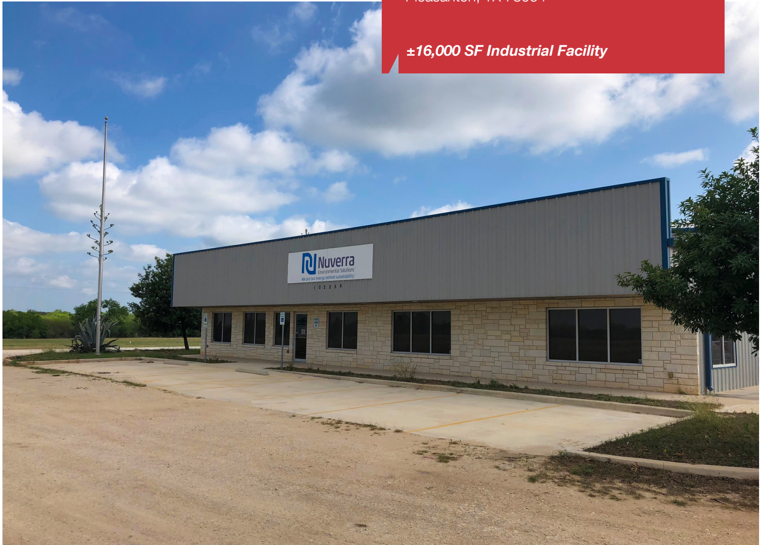
Exterior - Front