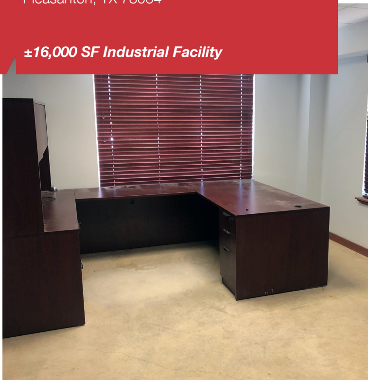
Interior - Building 1