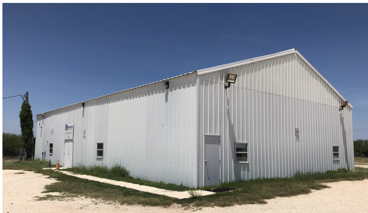
Exterior - Building 2