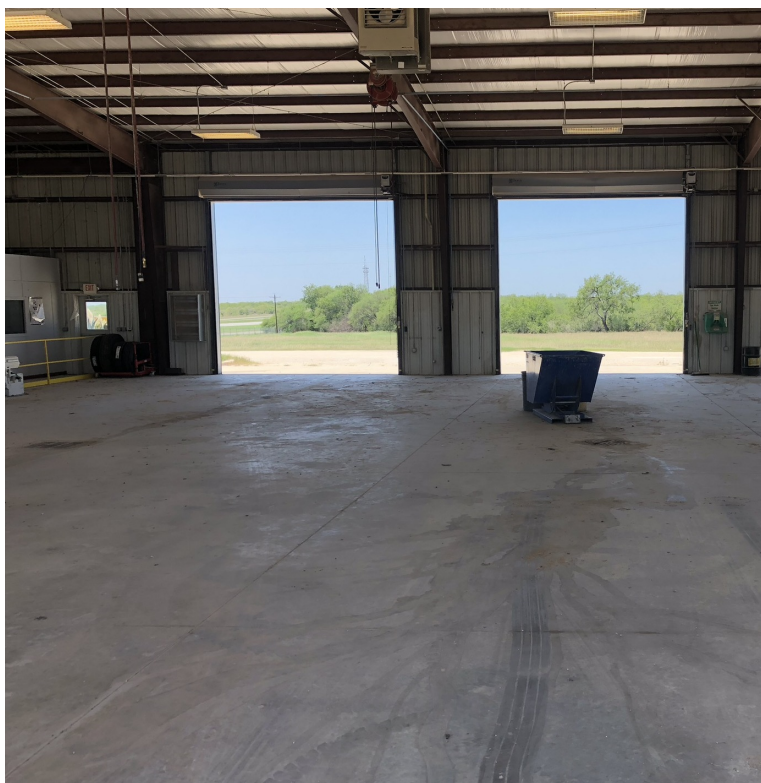
Warehouse - Building 1