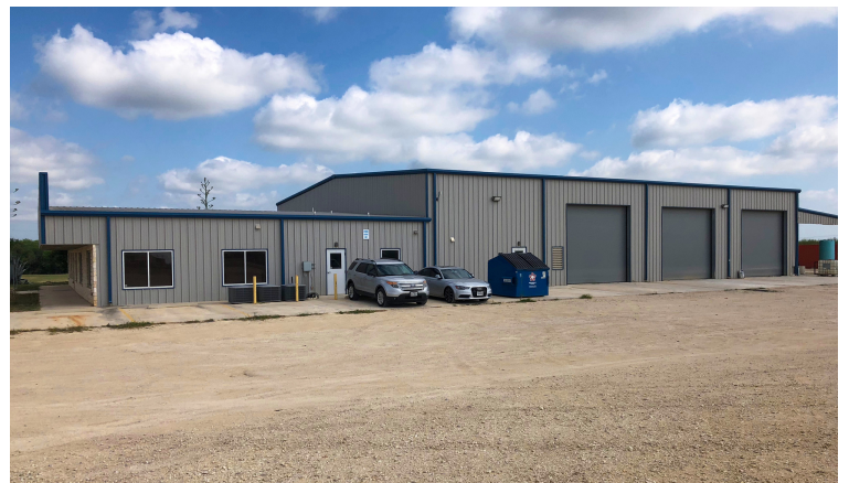
Exterior - Building 1