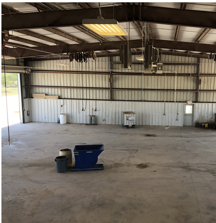
Warehouse - Building 1