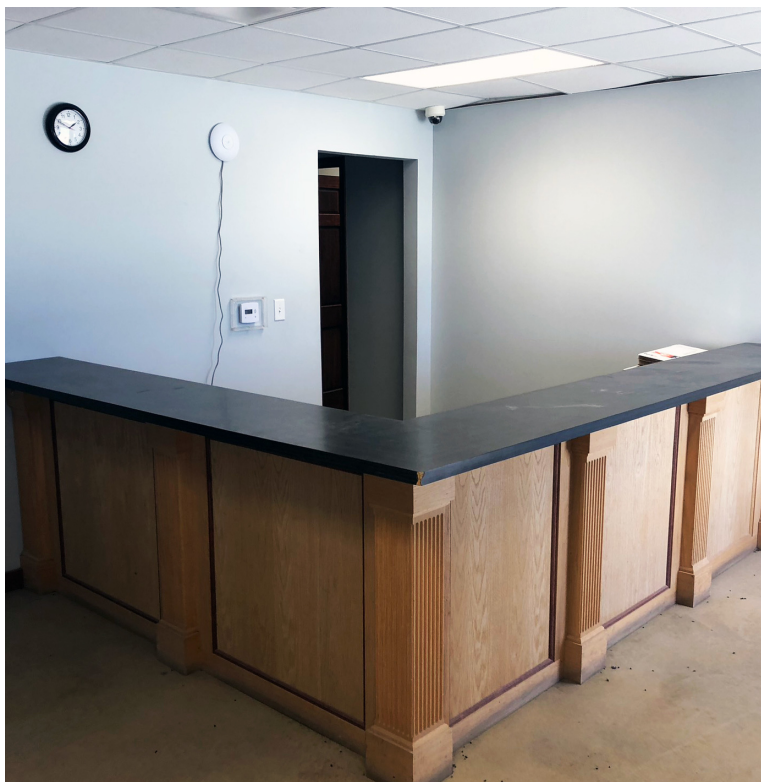
Interior - Building 1