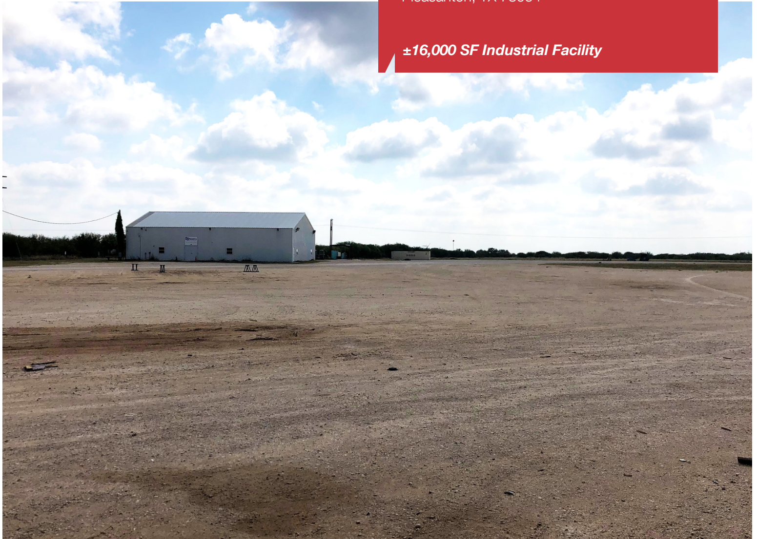
Exterior - Building 2