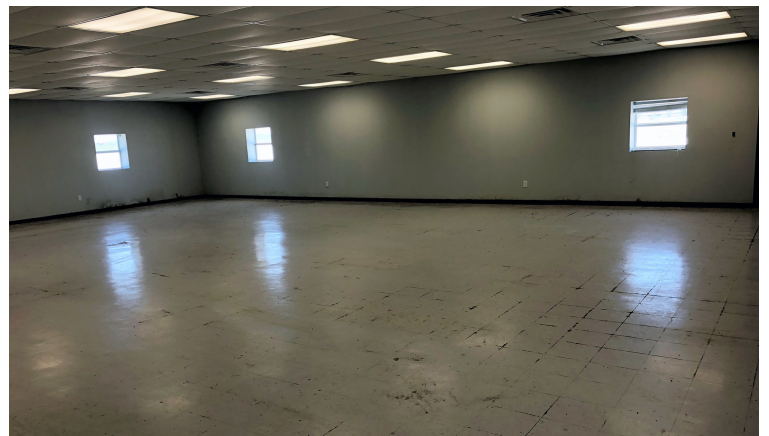
Interior - Building 2