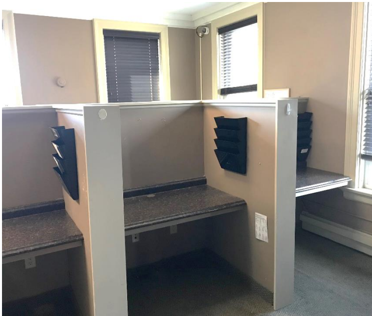
Cubical on second and third floor