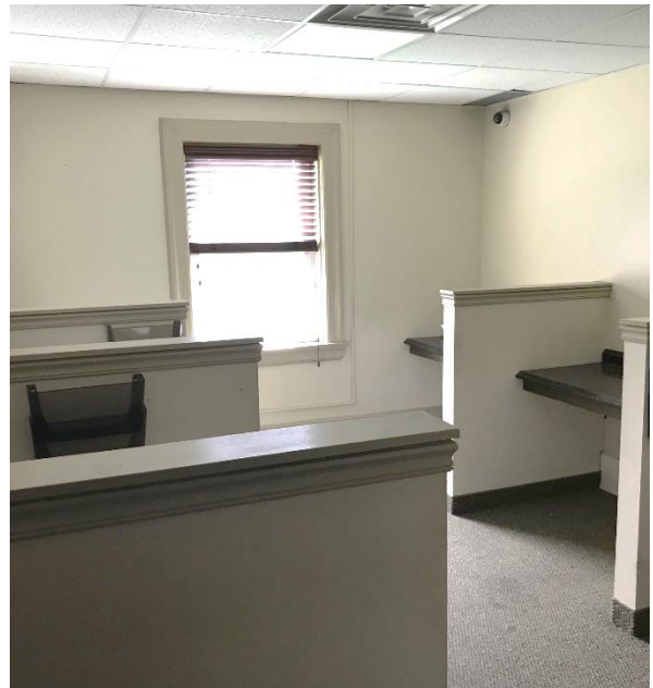
Cubical on second and third floor