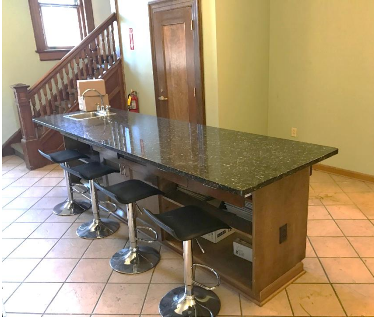
Breakroom – Kitchenette