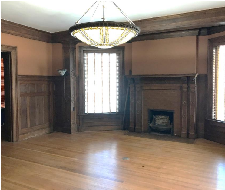
Second Floor - Standard Office