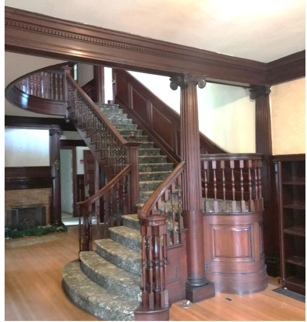
Grand Staircase 1 st floor - Main entrance