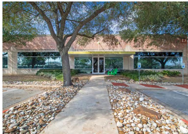
Top, left, right: Building A exterior, courtyard seating area near Building D, Building D exterior