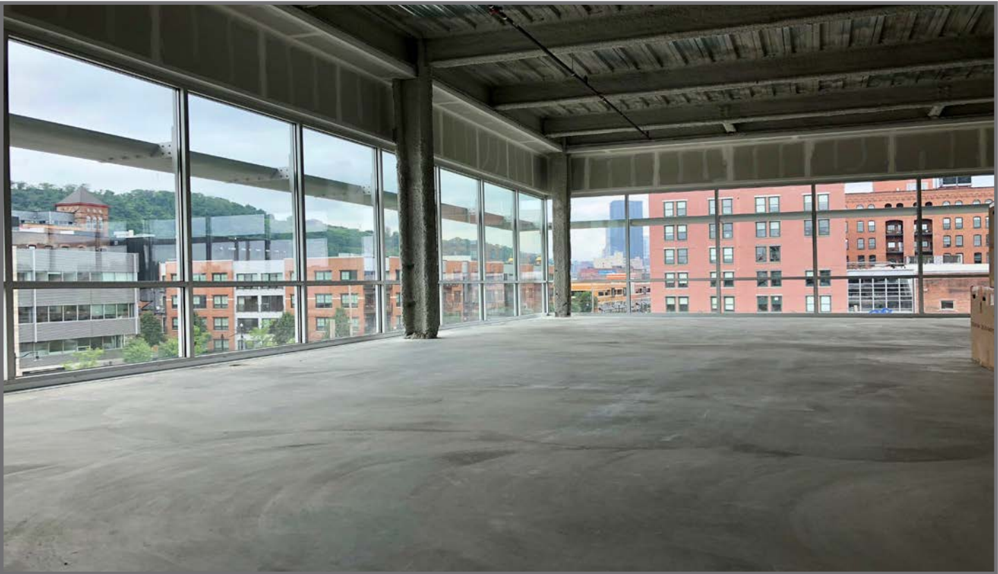
Third Floor - 4,905 RSF