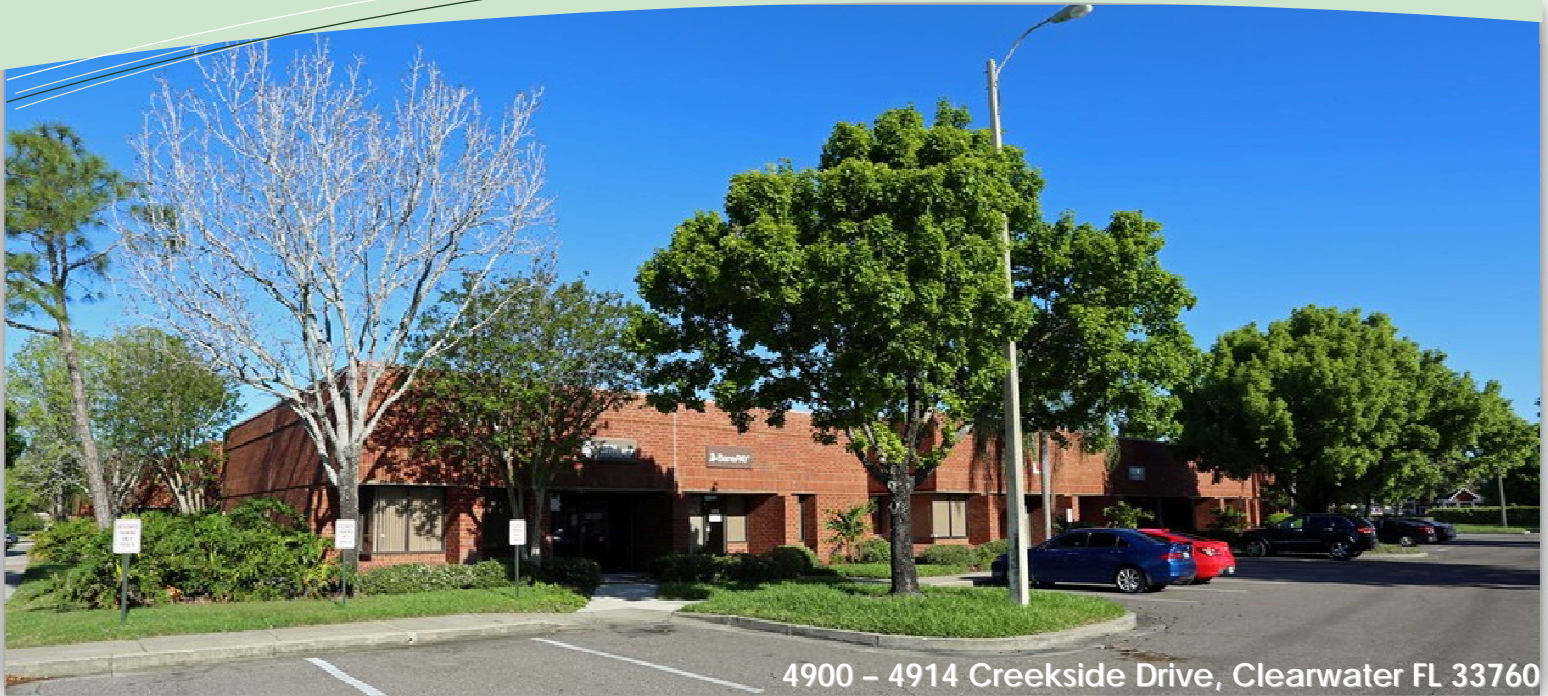
4900 - 4914 Creekside Drive, Clearwater FL 33760