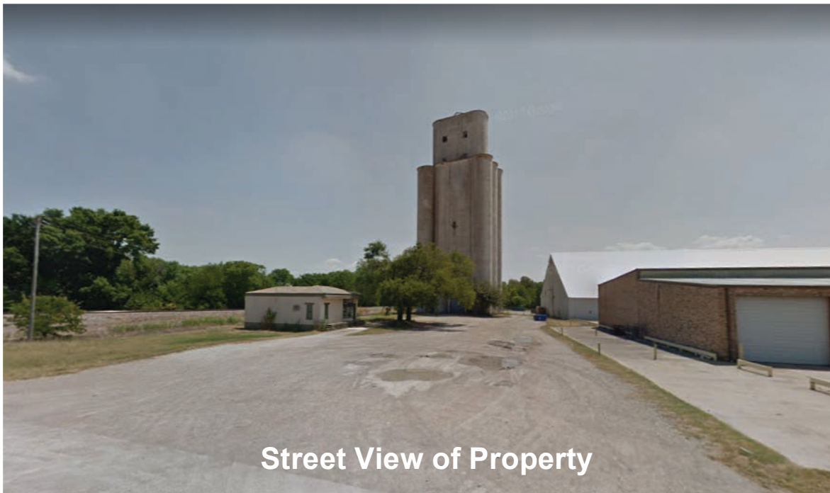
Street View of Property