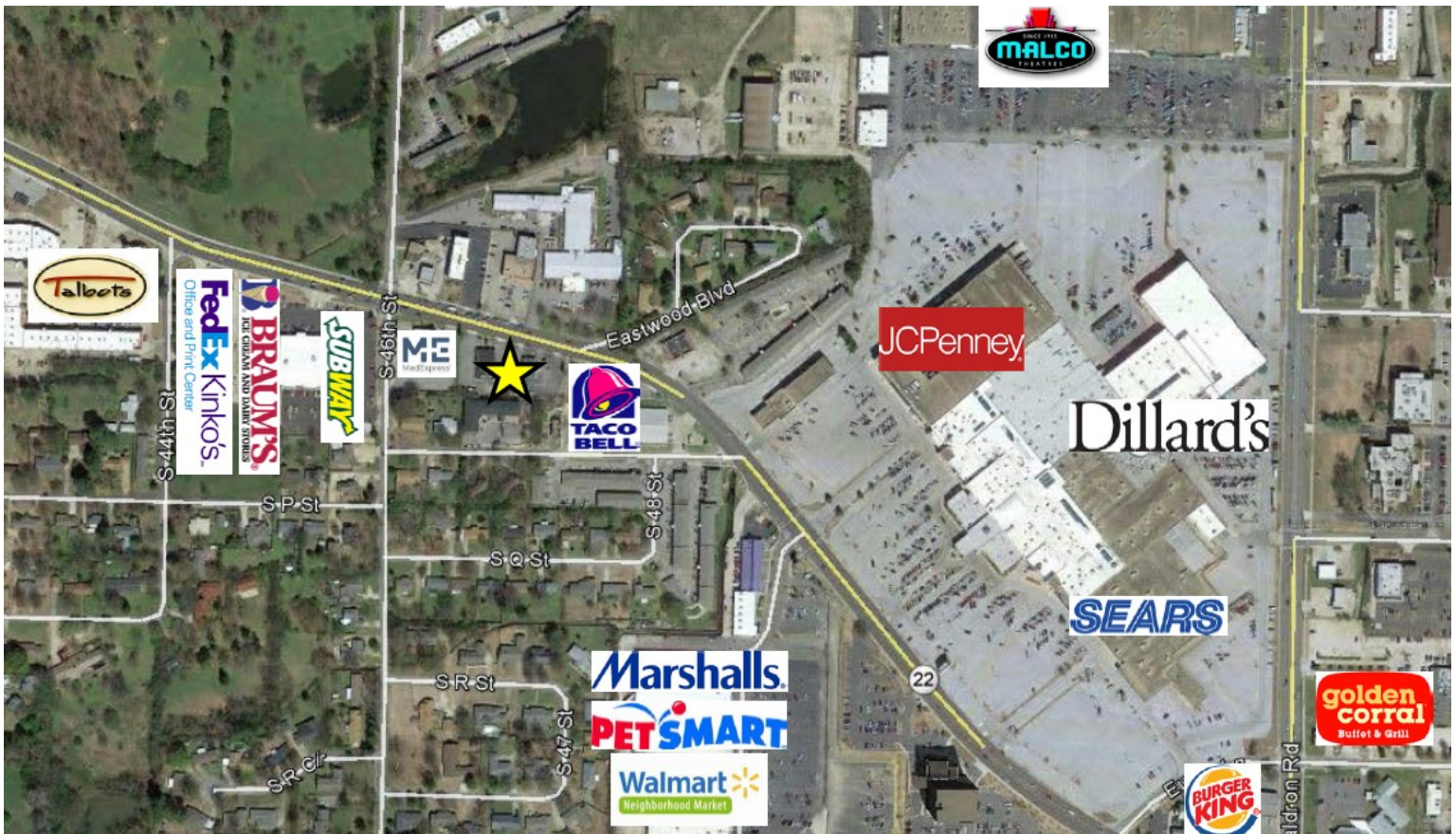
Advertised available Retail Space denoted by Star on above map

Ghan & Cooper Commercial Properties is offering space in a new retail development on Rogers Ave that will be available in 2017. Located at a pinnacle location less than 600' away Fort Smith's regional shopping mall as well as access to a traffic light.