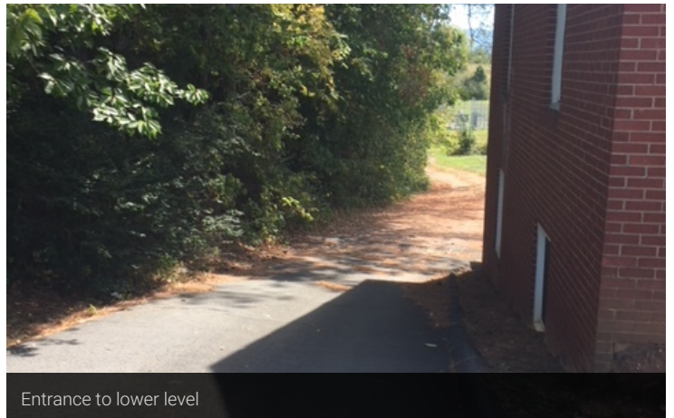
Entrance to lower level