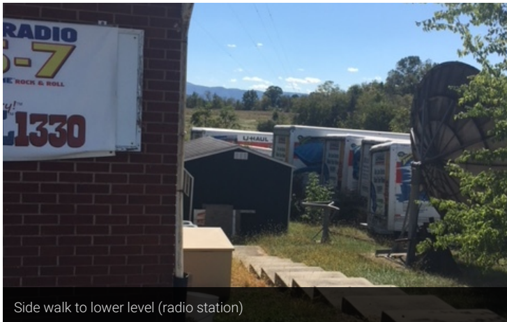
Side walk to lower level (radio station)