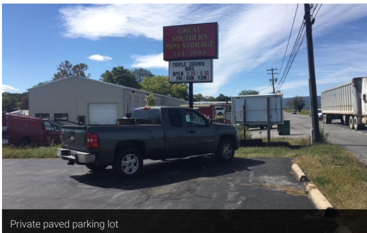
Private paved parking lot