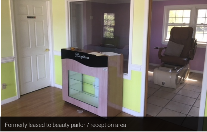
Formerly leased to beauty parlor / reception area