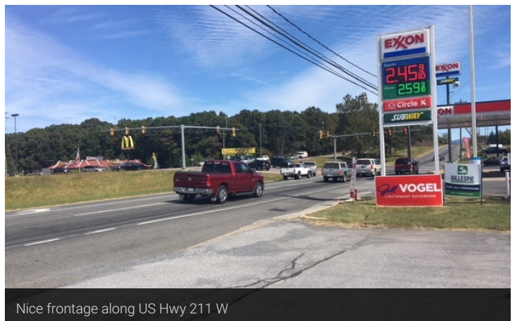
Nice frontage along US Hwy 211 W