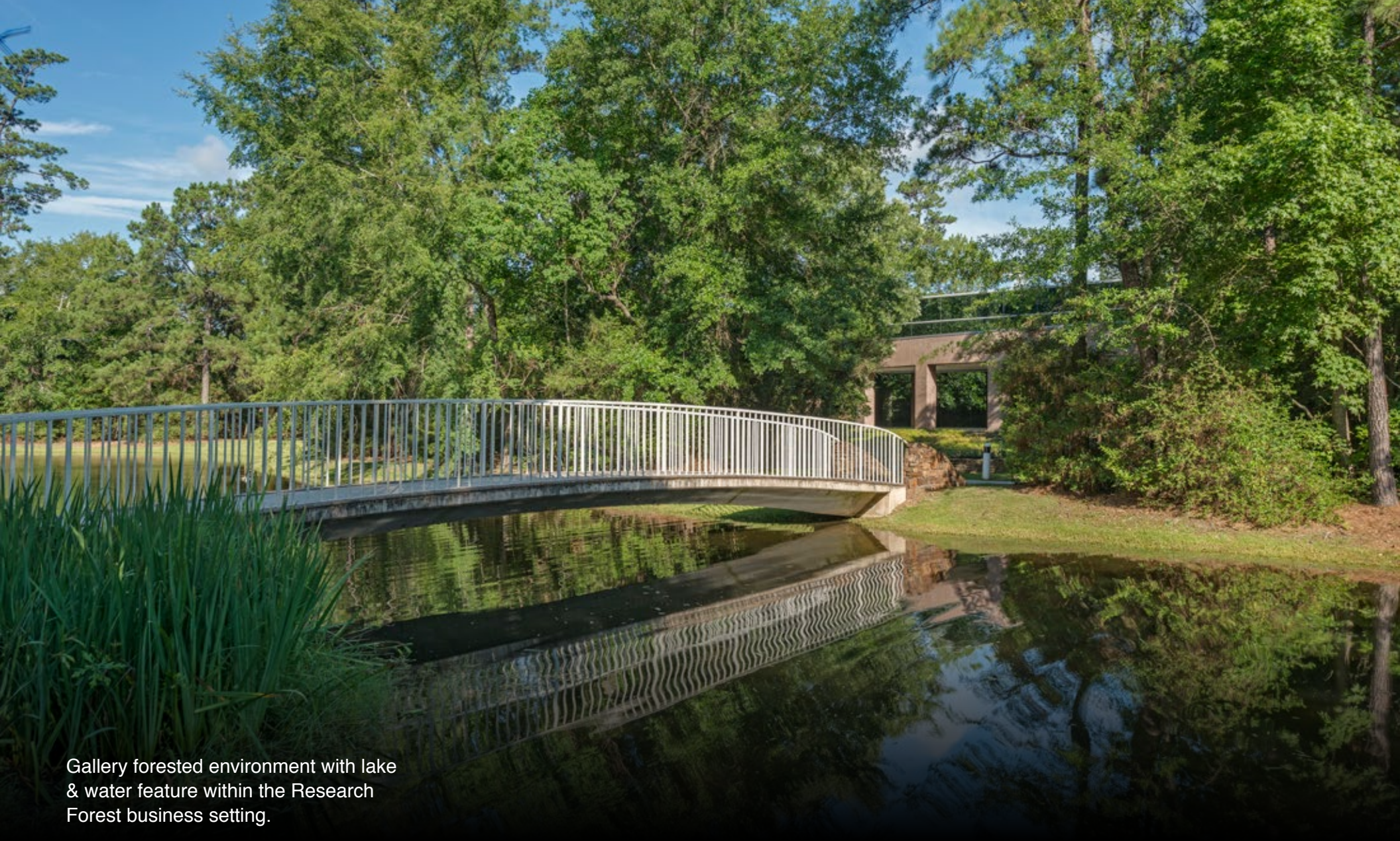
Gallery forested environment with lake & water feature within the Research Forest business setting.