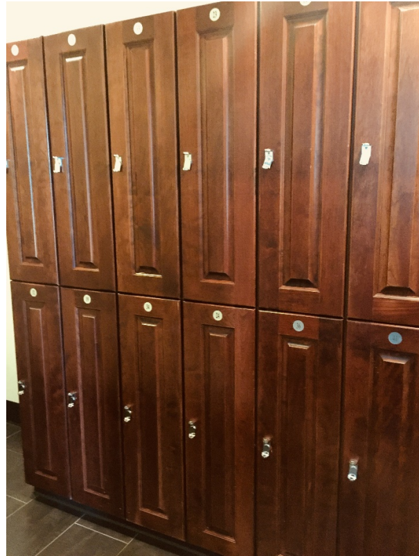
Elegant Locker Rooms