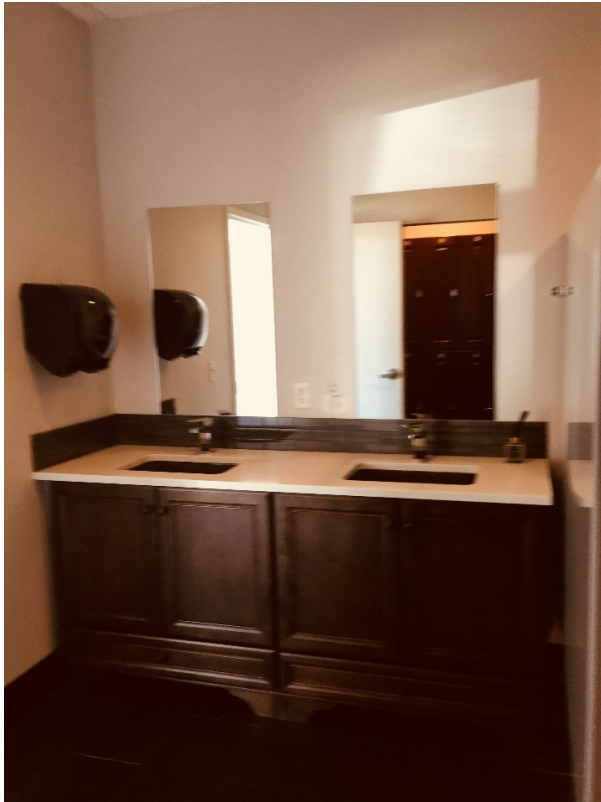
Newly Renovated Bathrooms