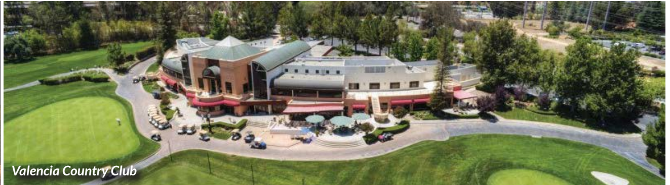
Valencia Country Club