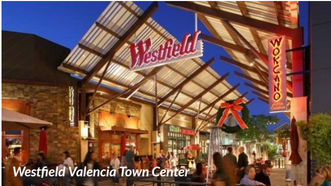
Westfield Valencia Town Center