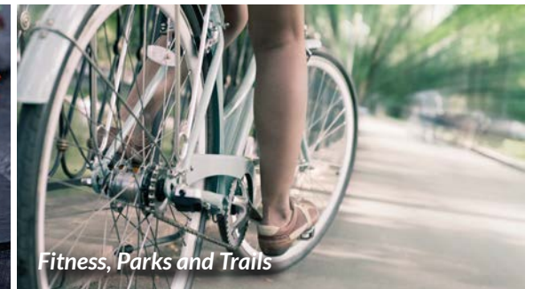
Fitness, Parks and Trails