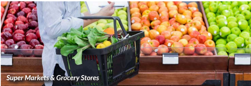
Super Markets & Grocery Stores