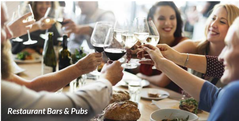
Restaurant Bars & Pubs