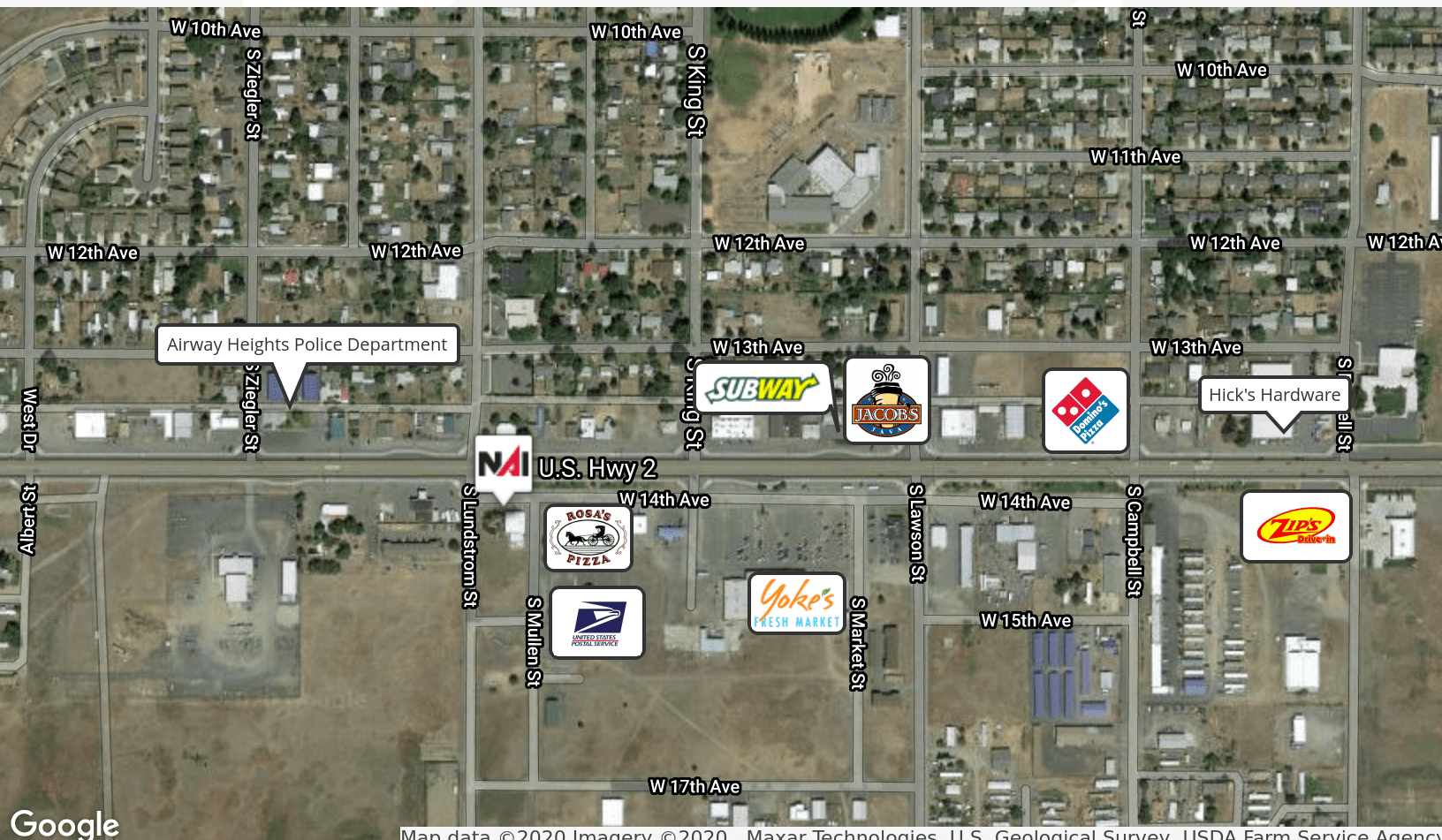
Map data ©2020 Imagery ©2020 , Maxar Technologies, U.S. Geological Survey, USDA Farm Service Agency