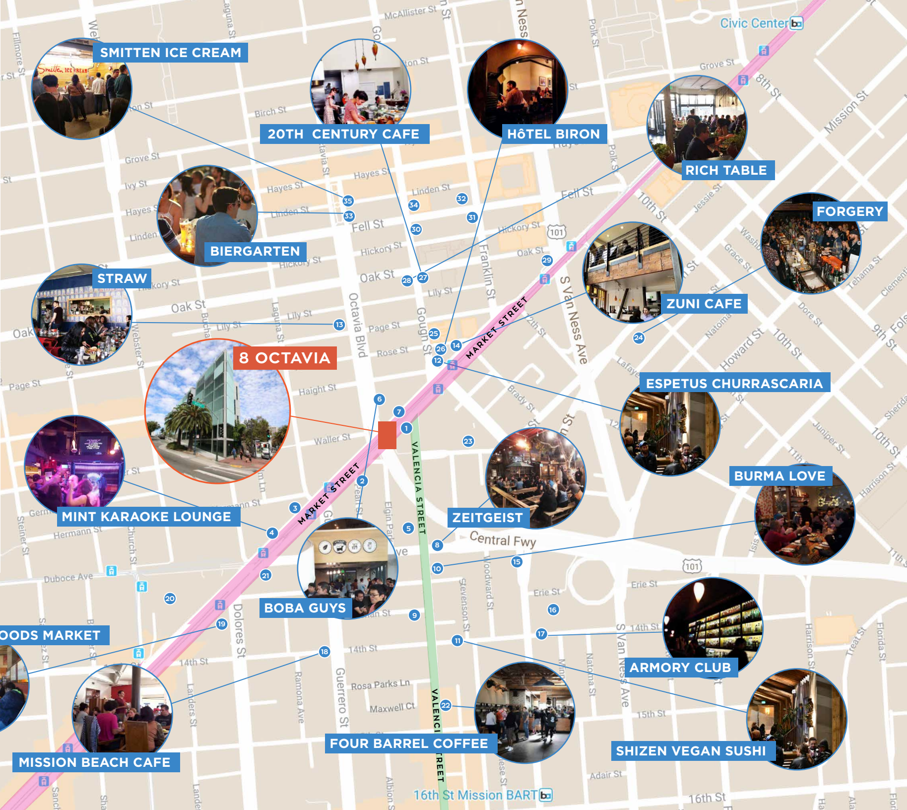
SMITTEN ICE CREAM