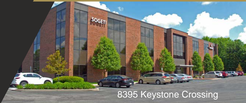
8395 Keystone Crossing