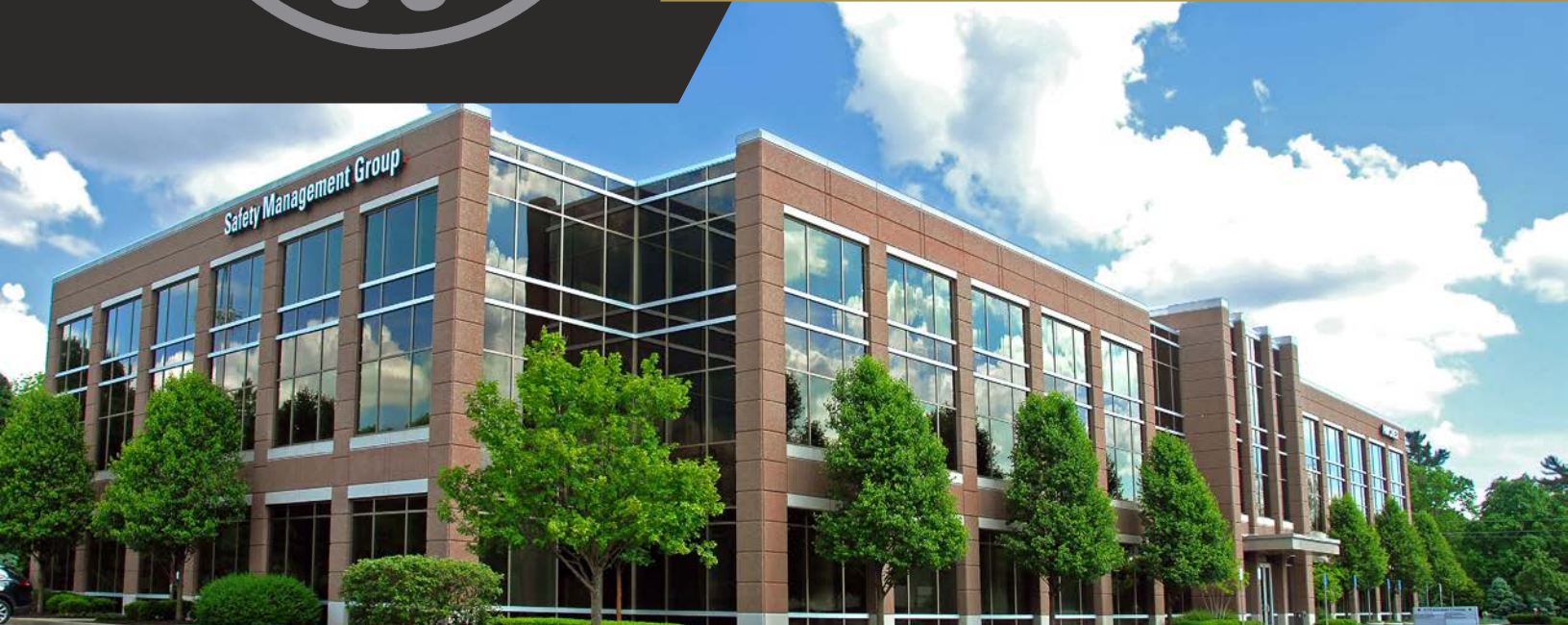
8335 Keystone Crossing