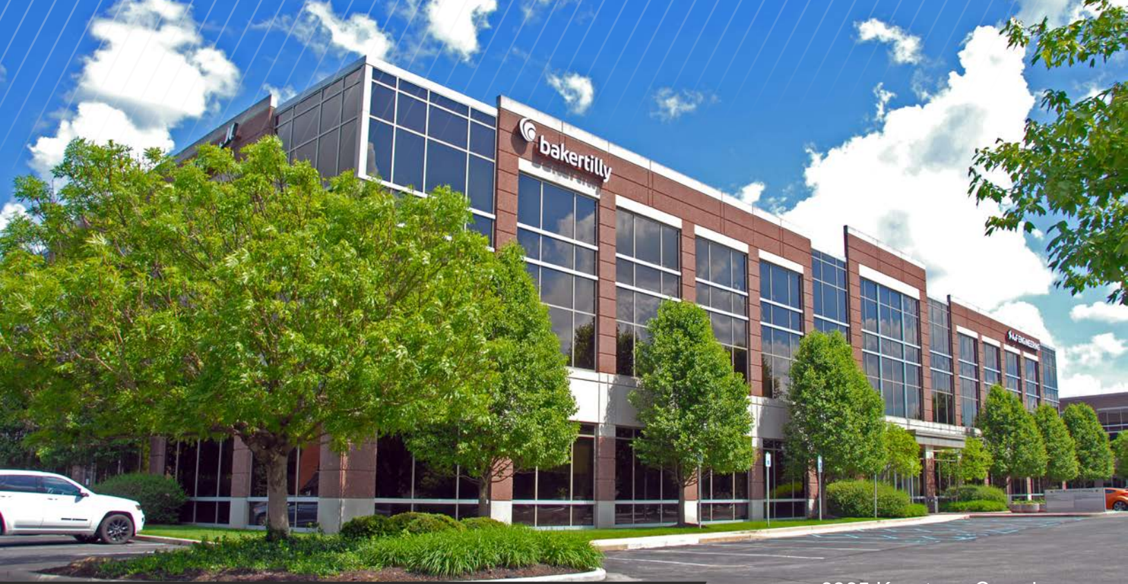
8365 Keystone Crossing