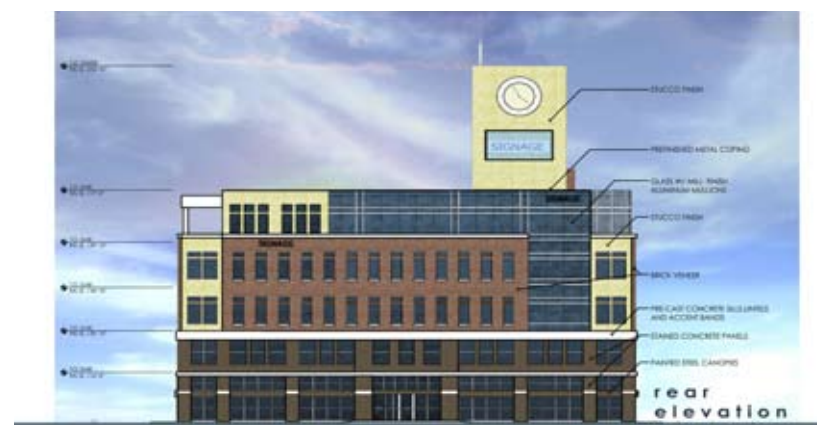
5 Story Building