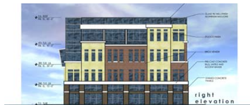
4 Story Building Side View