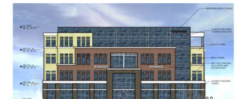
4 Story Front View

Each of the three buildings boasts the highest profile I-15 visibility -- particularly the 5-story flagship building with iconic clock tower and signage display directly on I-15 frontage. This project identification with time signature will establish its branding and prominence for years to come.