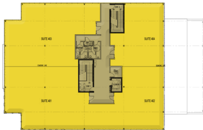
Fourth Floor Plan