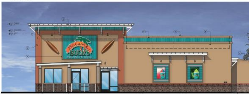
NORTH ELEVATION SCALE: 1/4" = 1'-0"