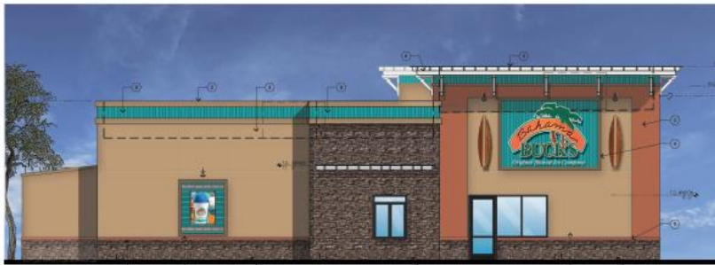
SOUTH ELEVATION SCALE: 1/4" = 1'-0"