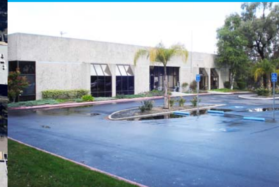
DRIVE AROUND TRUCK ACCESS