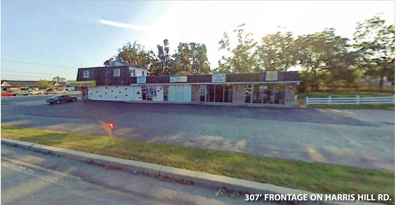
307' FRONTAGE ON HARRIS HILL RD.