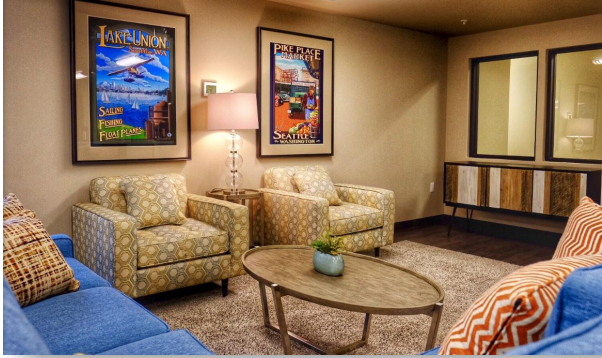
Adriana Community Room

The Adriana 22525 7th Ave S | Des Moines, WA 98198