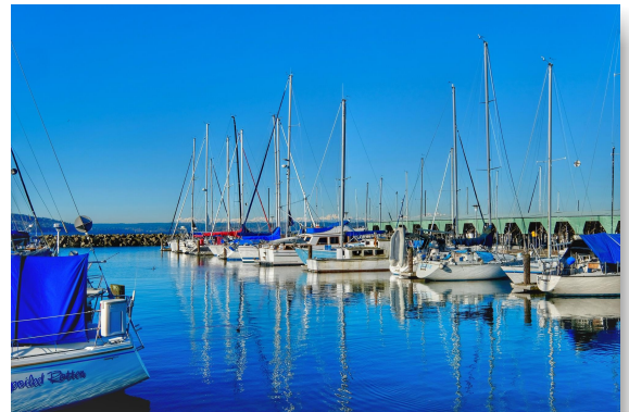
Walking Distance to Des Moines Waterfront