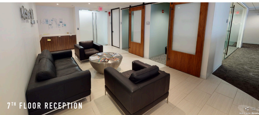
7 TH FLOOR RECEPTION