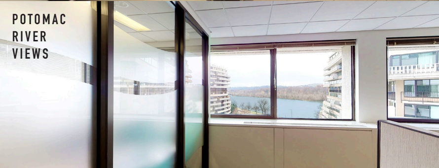
POTOMAC RIVER VIEWS