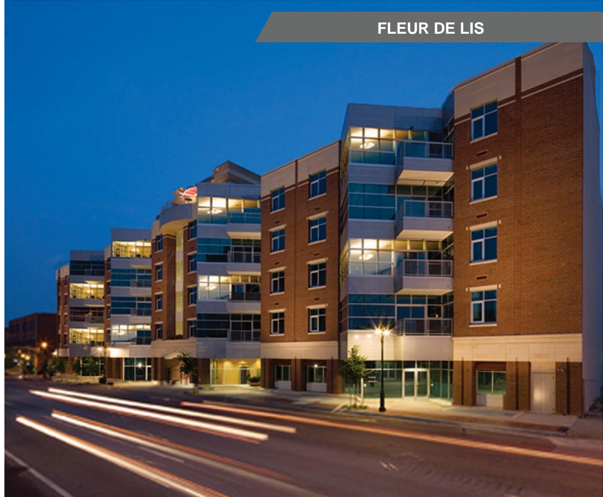
FLEUR DE LIS