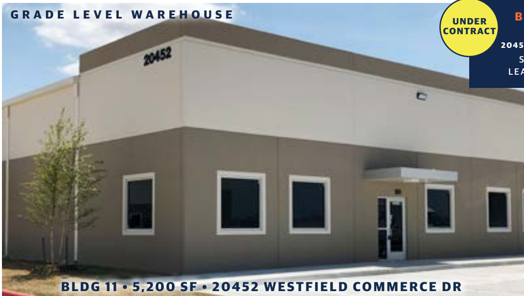
GRADE LEVEL WAREHOUSE