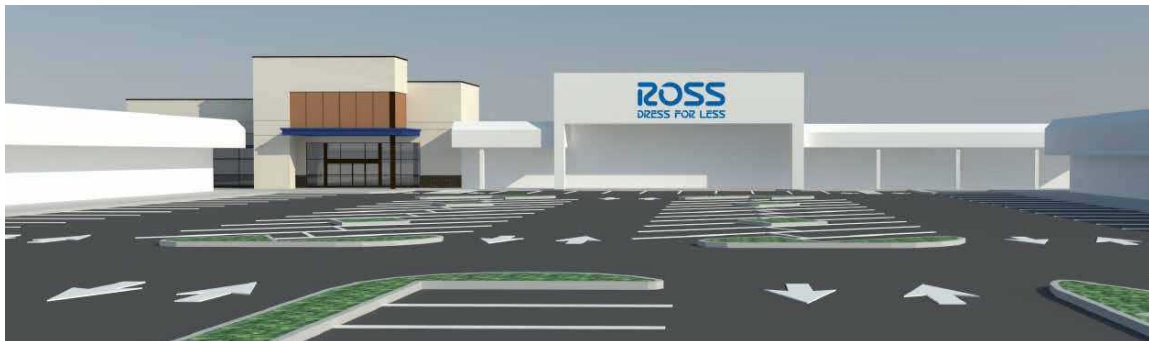
*Proposed facade improvements.

11,958 SF $9.00-12.00 PSF, PLUS NNN JUNIOR ANCHOR SPACE WITH VISIBILITY FROM HWY 509!