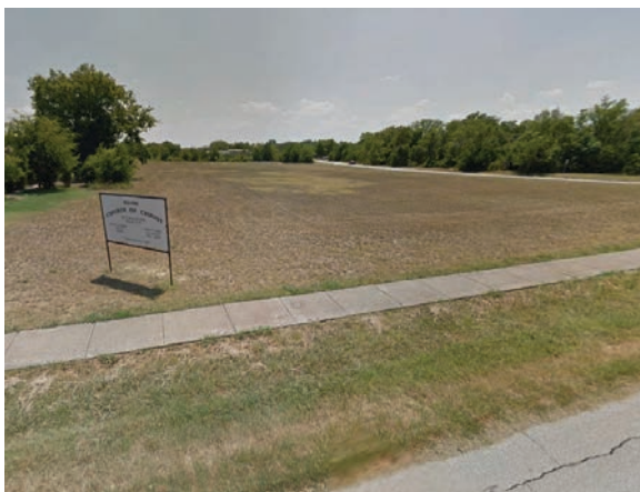
Street view from E. Pleasant Run Rd.