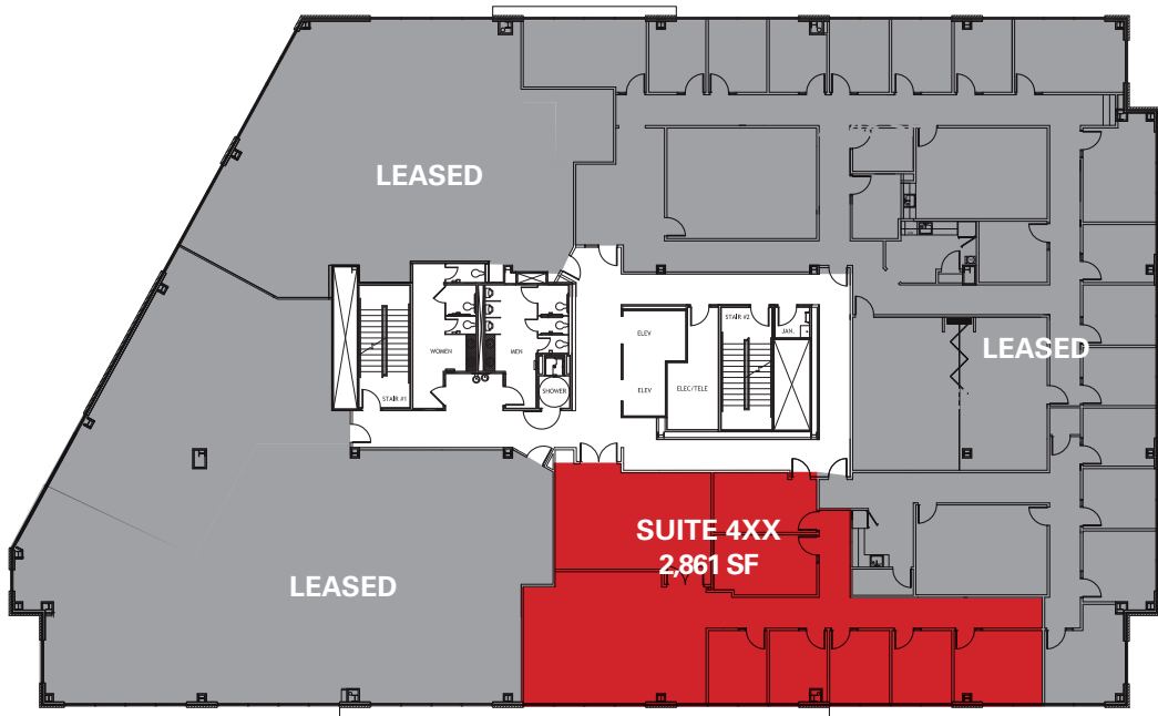
4th Floor 2,861 SF