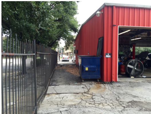
SIDE OF BUILDING