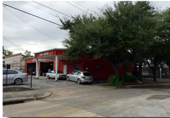
SIDE OF BUILDING