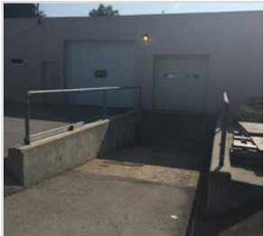
Dock / Drive-In Area