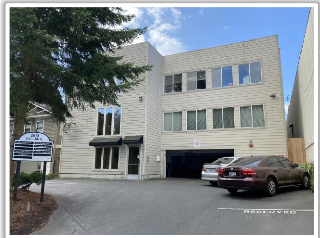
This location is in the Meadowbrook neighborhood in North Seattle.

To speak with us directly about this office space or showing, please email reception@loefflerlegal.com or call us today: (206) 443-8678.